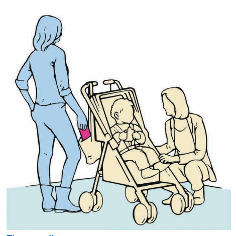
The easy dip